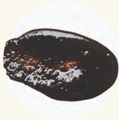
KAFFIBRE® in a scrub

KAFFIBRE® is milled to a smaller particles size (<150 µm), making it easier to incorporate in