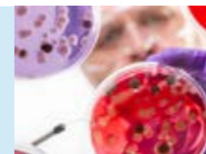
A team of scientists familiar with the mechanisms of Research.

A class IIB medical device designed for the healing of chronic wounds (bedsores and ulcers). This is an absorbable medical device with an implantable matrix for cavity wounds.